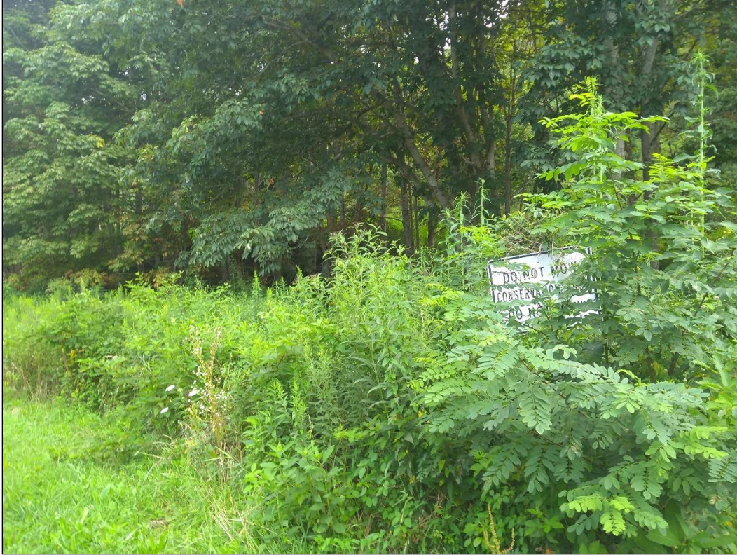
Photo 1 – View of southern boundary of site with NCDOT signage present.